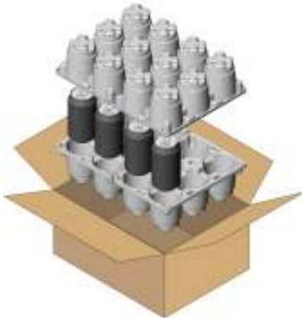
To ship 12 cans, use 2 Shippers:

Addresses the growing demand for Wine, Craft Beer, Ciders, or Alternative/Energy Drinks in cans as a convenient and sustainable option for consumers to enjoy their favorite liquid refreshments.