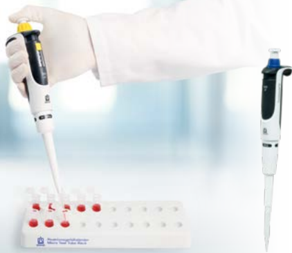
Transferpette ® S single channel pipette