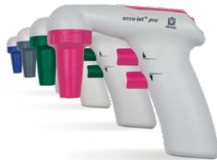
accu-jet ® pro pipette controller