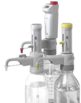
Dispensette ® S bottle top dispenser