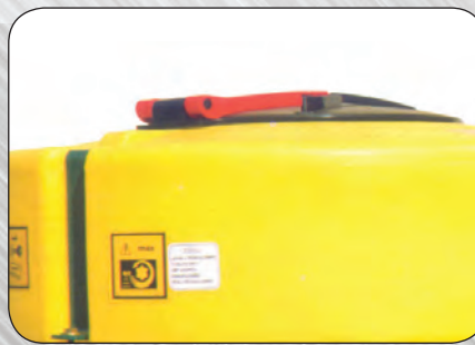
Hinged Vented Cover