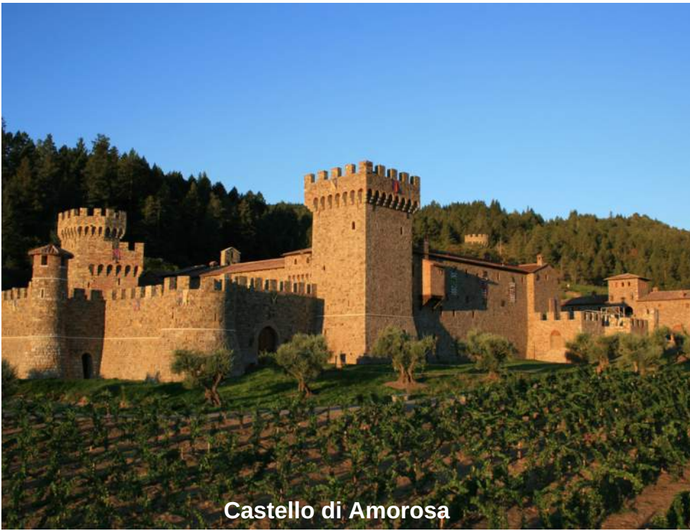
Castello di Amorosa