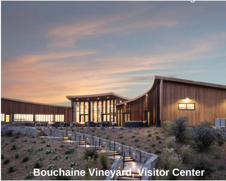
Bouchaine Vineyard, Visitor Center