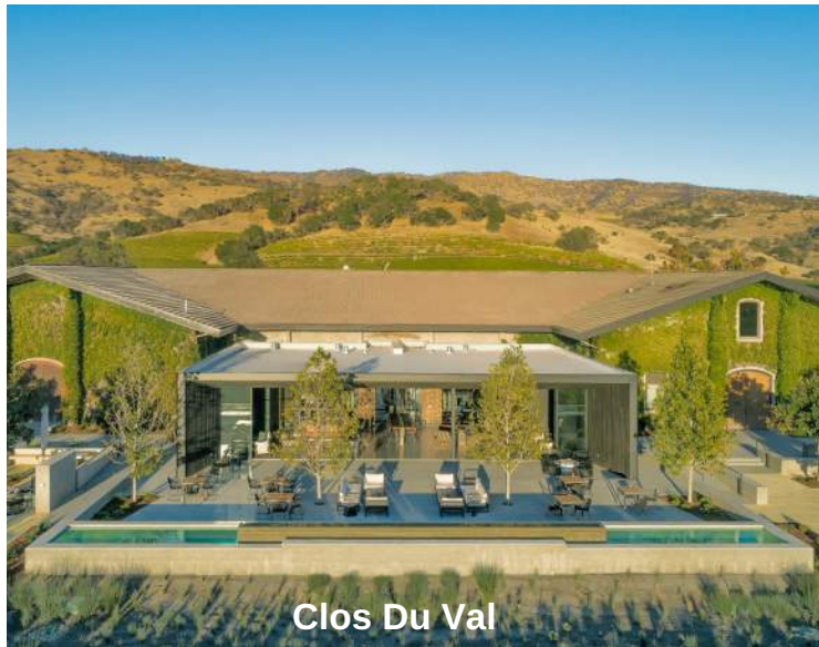
Clos Du Val