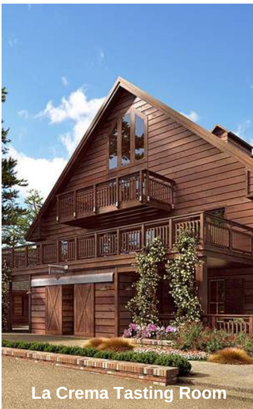
La Crema Tasting Room