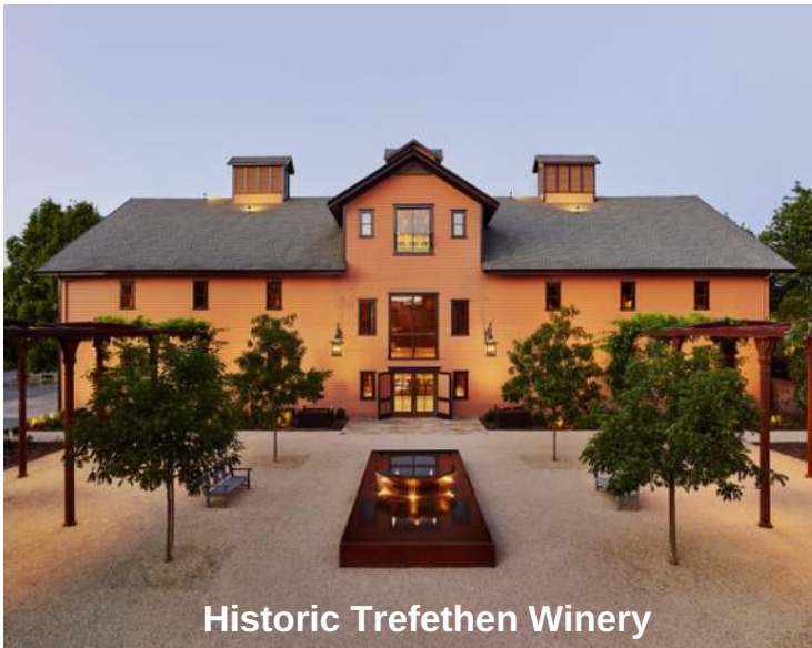
Historic Trefethen Winery