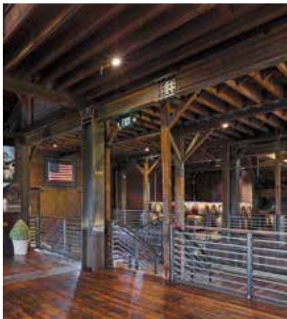
Figure 6. Finished interior at steel moment frame.