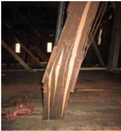
Figure 3. Damaged post at a step in the second-floor diaphragm.

beam connections where large splits developed at interior corners of cuts. Significant structural documentation was performed through multiple site visits to understand the existing framing systems and connections fully. A 3D point cloud survey was also taken of the structure in its deformed state to aid in shoring design and erection. When overlain onto a non-deflected Building Information Model, the 3D point cloud helped to illustrate existing atypical framing and provide further insight into the extent of the deformations developed within the structure (Figure 4), as well as shape the retrofit strategy.