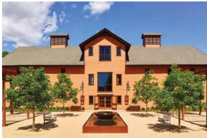
Figure 8. Renovations completed in 2017.

floor diaphragms were inadequate for seismic design forces as configured. The addition of new interior lateral force resisting elements reduced the existing diaphragm spans, allowing the diaphragm to remain without strengthening. Ordinary steel moment frames were selected to maintain the open post and beam feel of the space and to minimize the prescriptive detailing requirements. The flexible diaphragms in the east/west direction allow the gable end, wood shear walls to be designed for a standard Response Modification Coefficient (R) of 6.5, and interior ordinary steel moment frames be designed for an R-value of 3.5. Third-floor wood framed shear walls over moment frames were designed for the moment frame R-value. Steel frame columns were located immediately adjacent to existing timber posts to reduce their impact on the character of the space (Figure 6). Because of installation logistics,