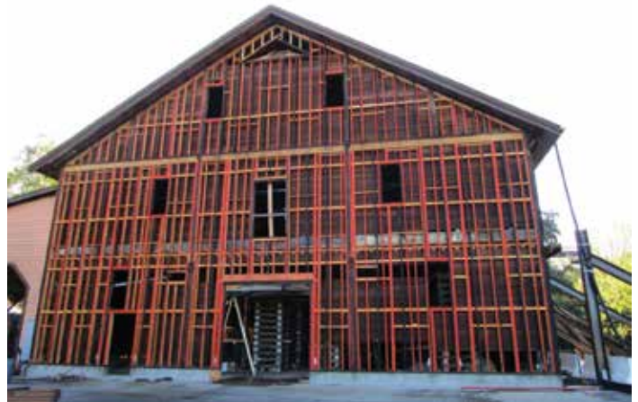
Figure 5. Retrofitted gable end wall framing.