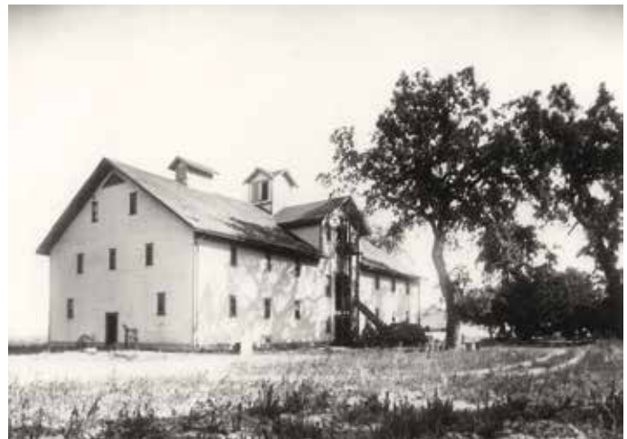
Figure 1. Historic Trefethen Winery building (Eshcol Winery c 1915).

The three-story winery structure is 125 feet by 60 feet and approximately 18,000 total square feet. Before the 2014 Napa earthquake, the building housed the Trefethen tasting room and offices, though the majority of the space was utilized for storage of wine in barrels. The building utilizes exposed 10- and 12-inch-square timber post and beam construction with exterior wood framed bearing walls. Wood framed floors are topped with layers of straight sheathing, and trussed roof framing is topped with skip sheathing and non-historic plywood. The second-floor diaphragm level is interrupted where the 24-foot-wide center bay is four feet lower than the adjacent primary levels, creating a discontinuity in the diaphragm. While the exterior of the