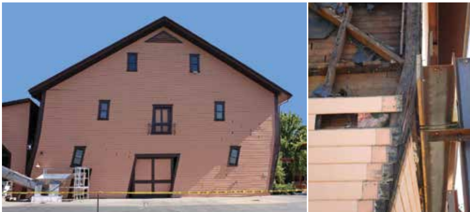
Figure 2. Post-earthquake deflection and localized damage at second-floor level.

first level to rotate and “walk” without resistance as the building cycled through deflections. While this lack of connection restraint released the lower level posts and beams from sustaining significant damage at connections, the magnitude of the deflection caused several first-floor posts to disengage completely from beneath the beams. Second level posts adjacent to the diaphragm step at the center bay were constrained within a several-foot-tall pony wall between the diaphragm levels. This resulted in a significant amount of flexural damage to the posts directly above the main second-floor level (Figure 3). Multiple posts at the upper levels sustained damage at let-in