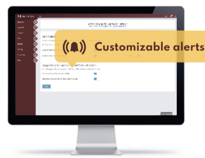
CUSTOMIZABLE ALERTS AND NOTIFICATIONS