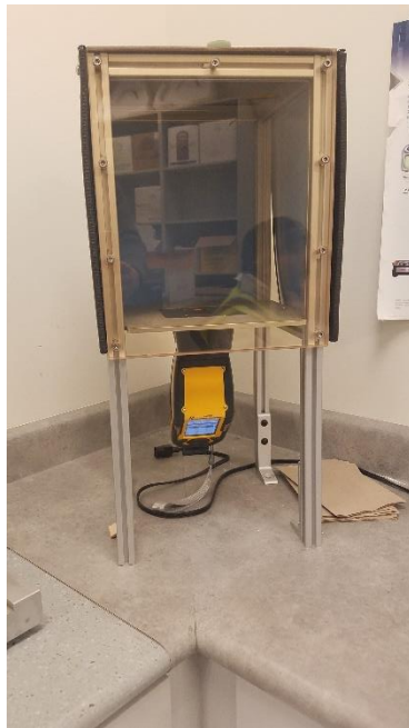
XRF Tests Heavy Metals