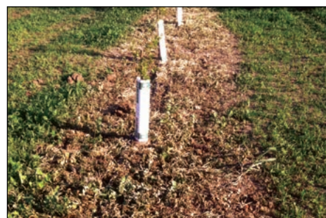
4 hours post-application