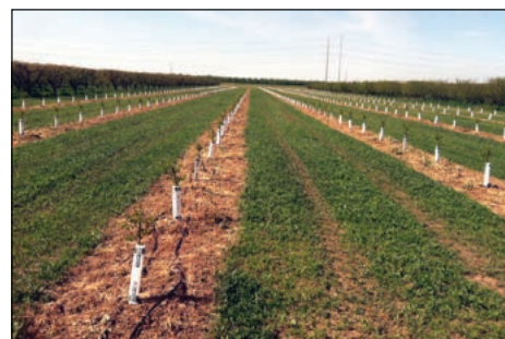
72 hours post-application