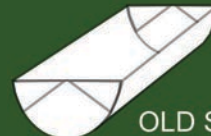
OLD STYLE (FOLD)