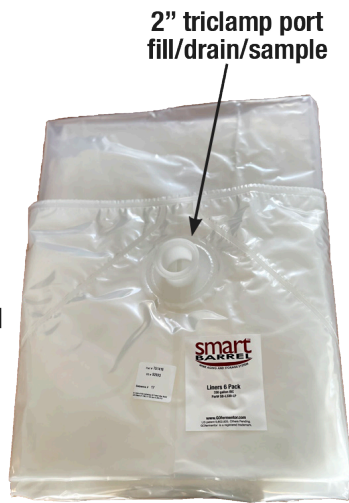
60 & 330 Gallon Liners $22.50 to $60/liner