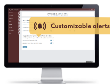
CUSTOMIZABLE ALERTS AND NOTIFICATIONS