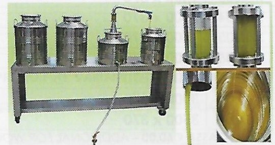
EXAMPLE SERIE DECANTER OIL