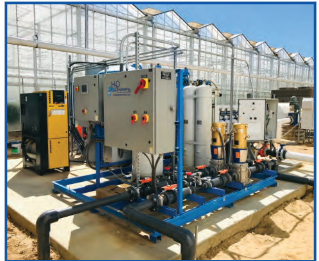
Example of our Ozone Disinfection System designed for the Indoor Agriculture market.

We are certified by the following agencies: