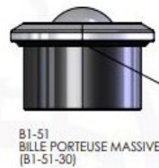
B1-51 BILLE PORTEUSE MASSIVE (B1-51-30)