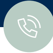
IVR (pay by phone)