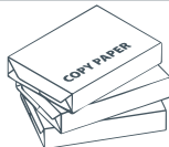
Paper Ream Wrappers (copier, office, colored, etc)

- Remove Metal or Spiral Bindings - (post-it notes, legal pads, etc)