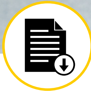
MATERIALS FOR CUSTOMERS AND/OR END USERS