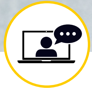
EDUCATION ON INDUSTRY LEADING CLEANING PRODUCTS