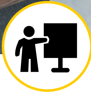
IN-PERSON TRAININGS ON HOW TO CLEAN