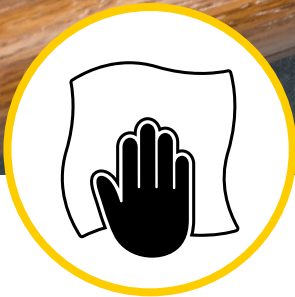
CUSTOMIZED CLEANING PLAN

Rubbermaid Commercial Products has solutions and processes to help your facility be prepared for the aftermath of COVID-19.