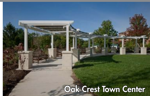
Oak Crest Town Center