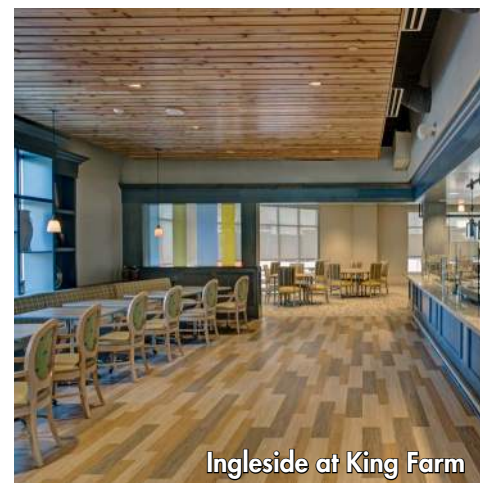
Ingleside at King Farm