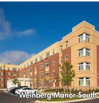
Weinberg Manor South