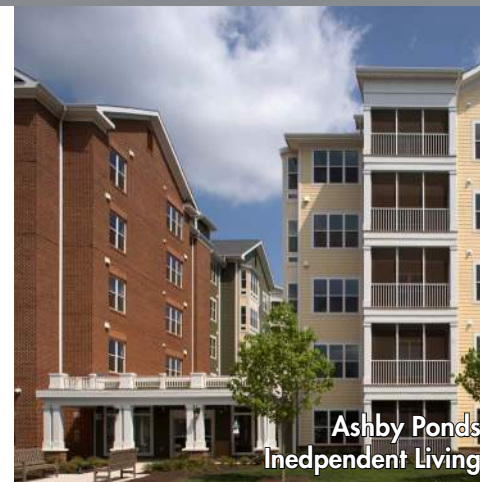
Ashby Ponds Independent Living