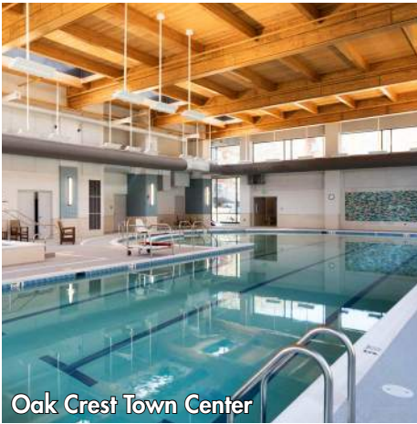
Oak Crest Town Center