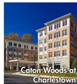
Caton Woods at Charlestown