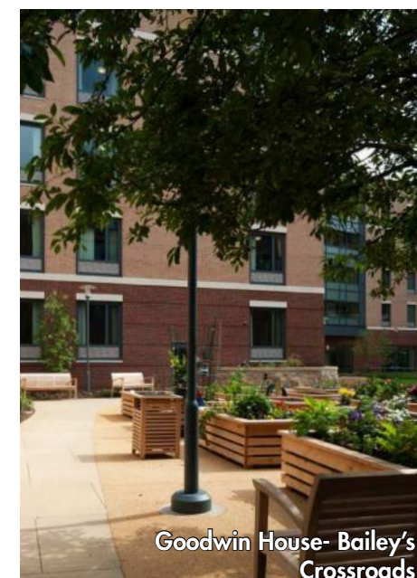
Goodwin House- Bailey's Crossroads