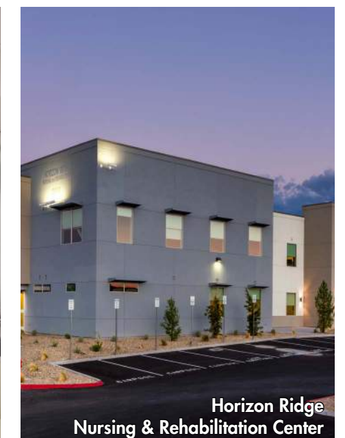
Horizon Ridge Nursing & Rehabilitation Center