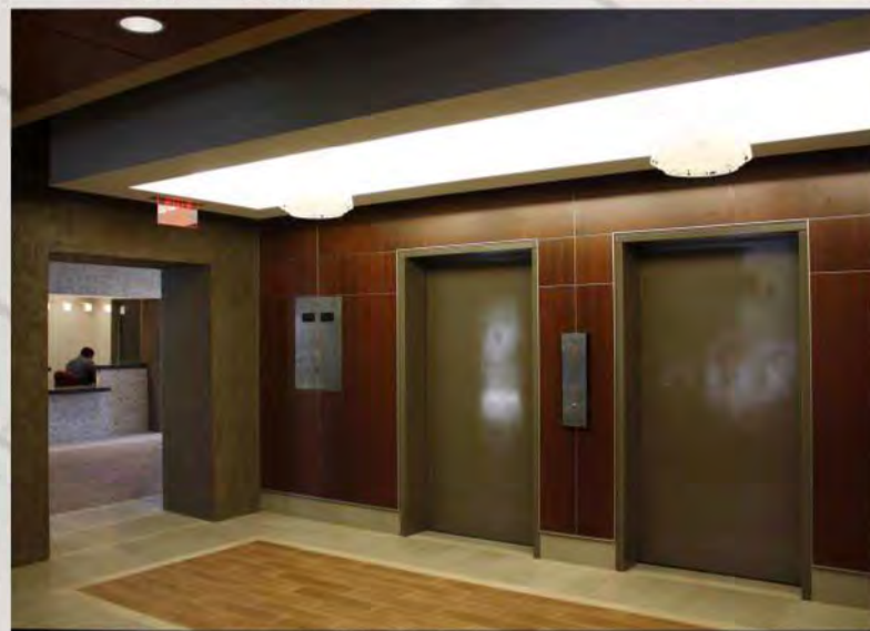
ELEVATOR LOBBY RENOVATION