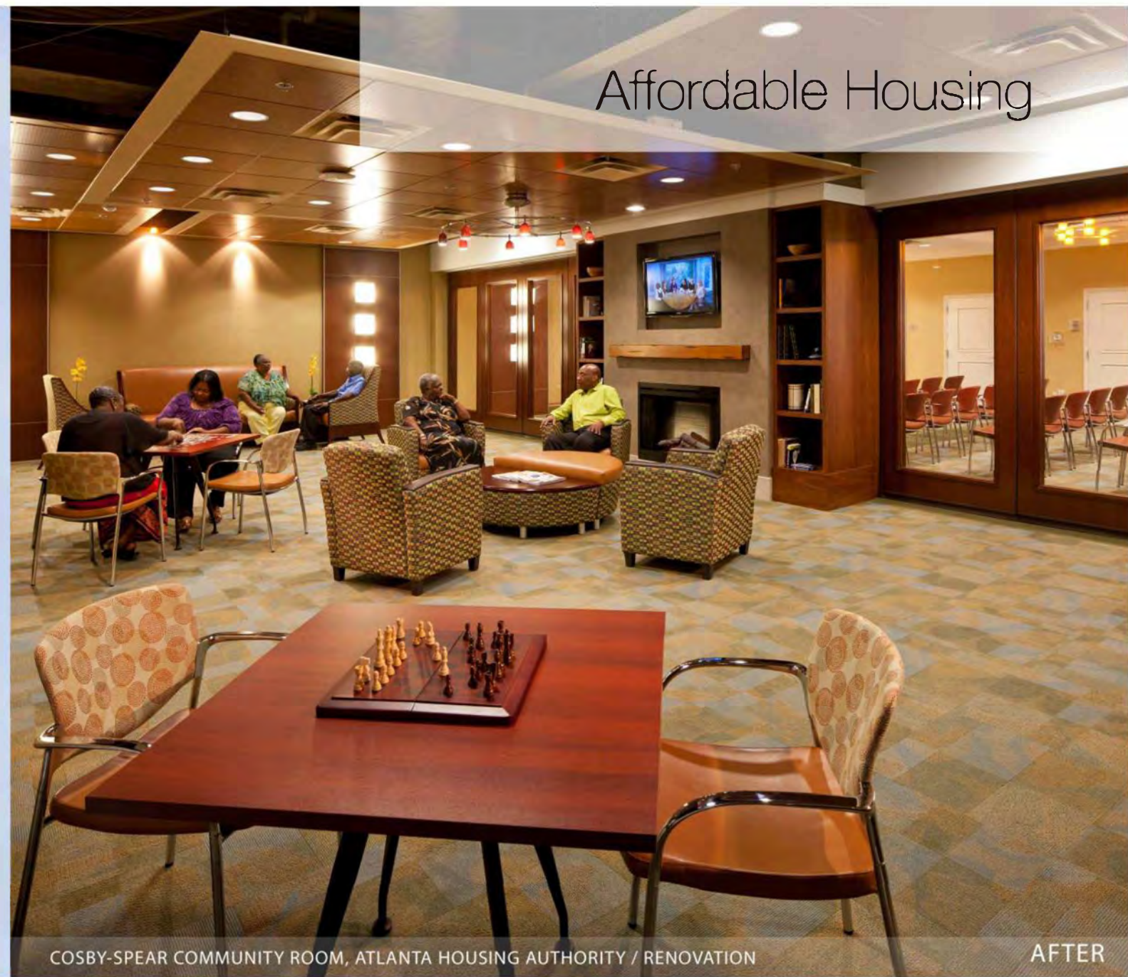
COSBY-SPEAR COMMUNITY ROOM, ATLANTA HOUSING AUTHORITY / RENOVATION