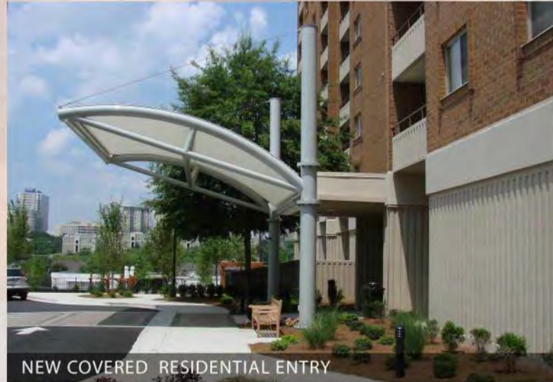
NEW COVERED RESIDENTIAL ENTRY