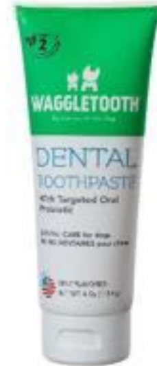
Waggletooth® Dental Toothpaste