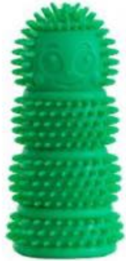
The Waggletooth® Dog Toothbrush