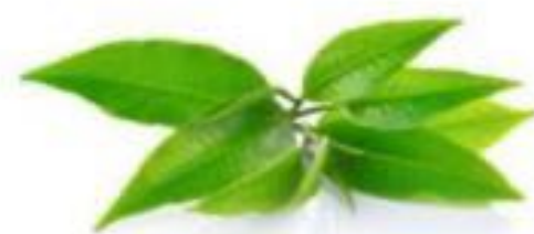
Green Tea Extract