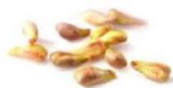
Grape Seed Extract