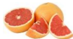
Grapefruit Seed Extract