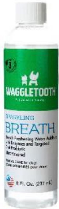
Waggletooth® Sparkling Breath water additive