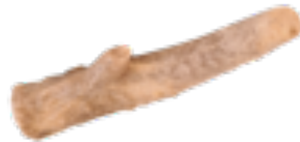
The Waggletooth® Dental Chew Antler