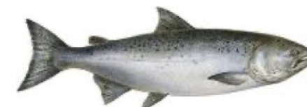
Wild Salmon Oil