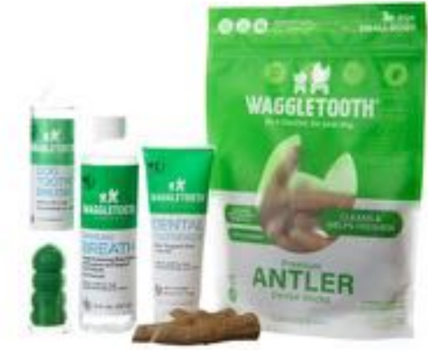
The Full Waggletooth® Line