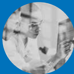
Biosimilars and Specialty Pharmaceuticals