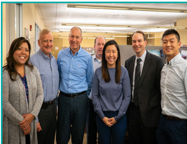
PGY2 Health System Pharmacy Administration Preceptors and Staff