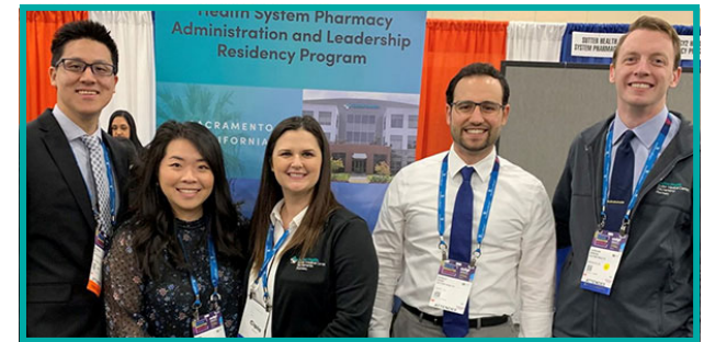
PGY2 Residency Recruitment Event ASHP 2019 in Las Vegas, NV