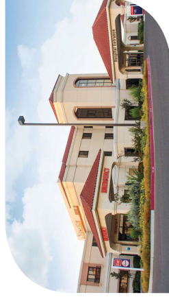
Adventist Health Hanford