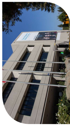
Adventist Health Tulare