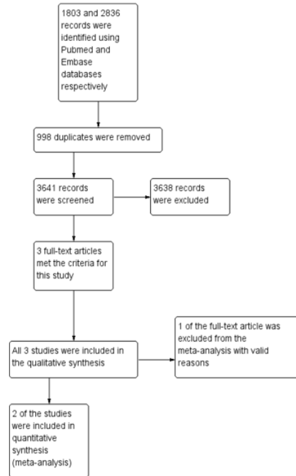
Figure 1 - Flow Diagram of Included Studies