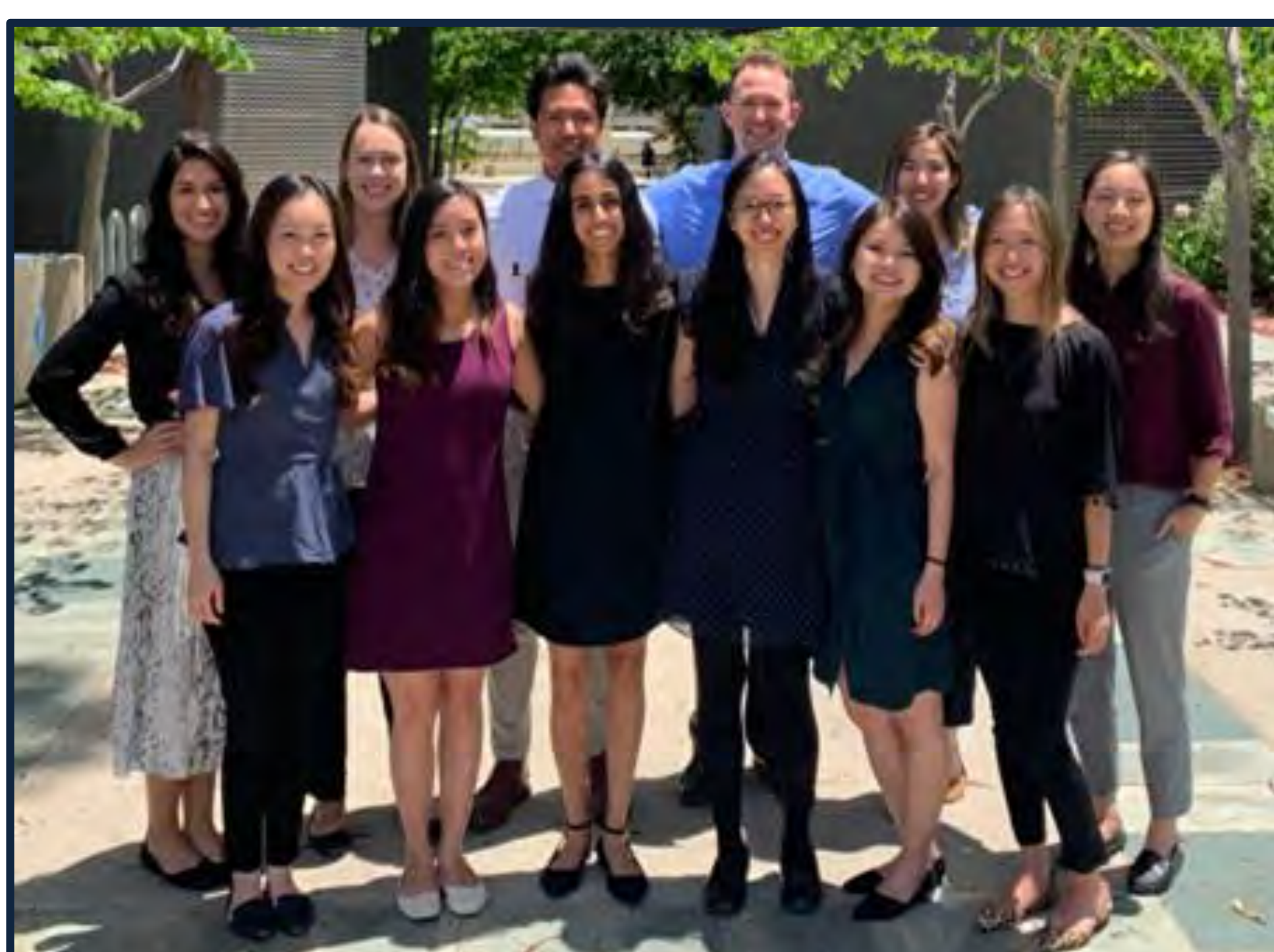
2020-2021 PGY2 Residency Class

Precept APPE students from UC San Diego and University of the Pacific