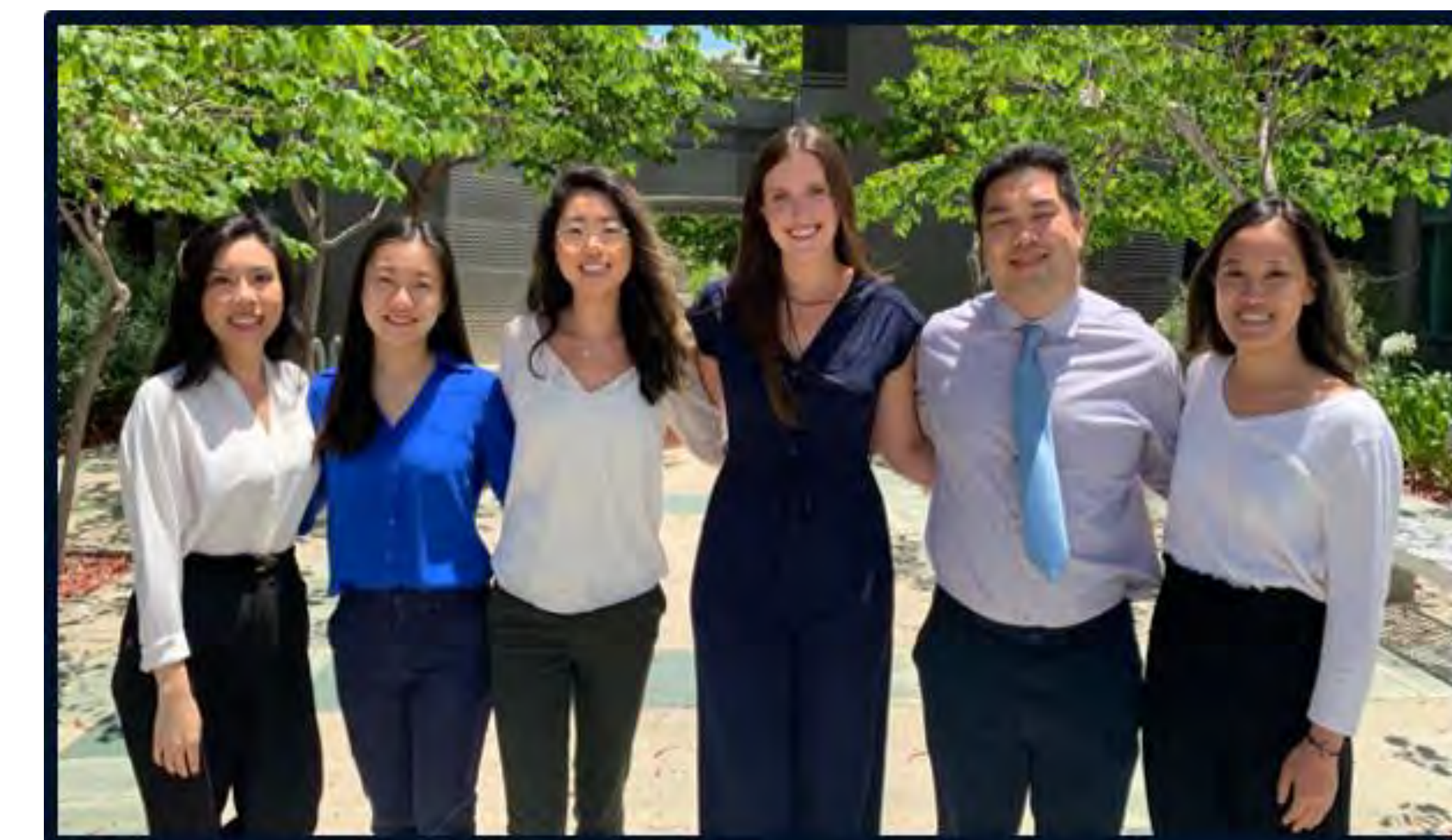
2020-2021 PGY1 Residency Class