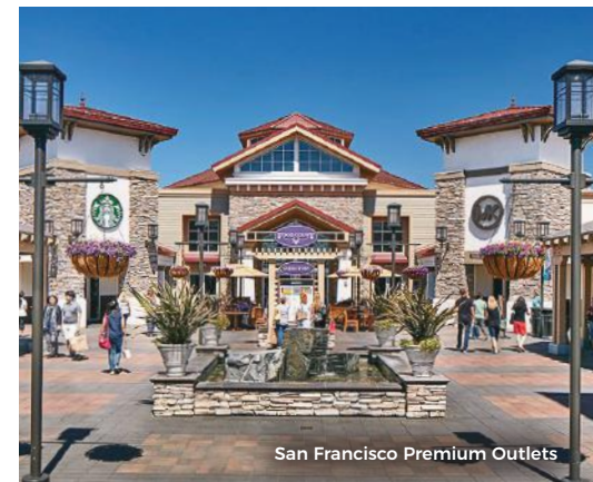
San Francisco Premium Outlets