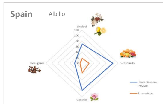
Figure 2. Comparison of aromatic compounds production of Hv205 vs. S. cerevisiae in fermentations of white Albillo grapes in vineyards from Ribera del Duero, Spain.