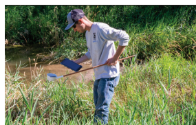
MOSQUITO & VECTOR CONTROL