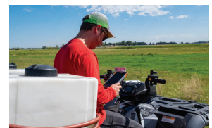
INVASIVE PLANT CONTROL