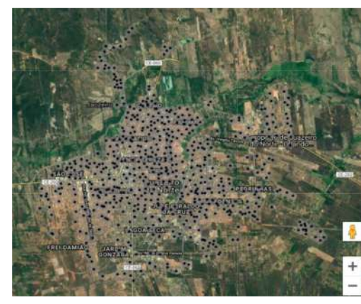
Map 1. Mosquitrap locations in Juazeiro do Norte/CE

During the analyzed period (from week 37/2019 to week 38/2020), the average execution of field visits was 97.89% in 54 weeks, 3,547 Aedes aegypti specimens (female and male) were collected in MosquiTRAPs (711 vectors captured in 2019 and 2,836 by week 38 of 2020) and weekly submitted to qRT-PCR by MI-Virus (Intelligent Virus Monitoring) for viral surveillance ( Chikungunya virus, Zika virus, Yellow fever virus, and all serotypes of Dengue virus).